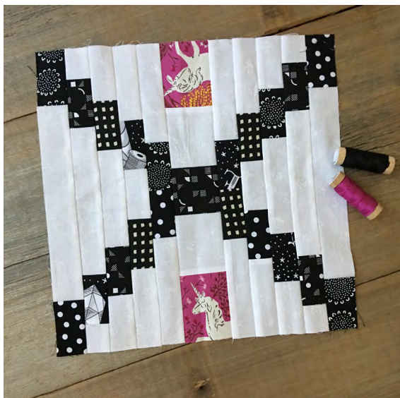
12" X 12" FINISHED